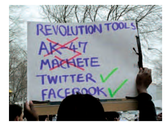
Tunisia and Egypt have some of the highest ICT levels in the region (nearly 10% of GDP).

Within social networks, trust works by imitation. This puts traditional forms of trust into question.